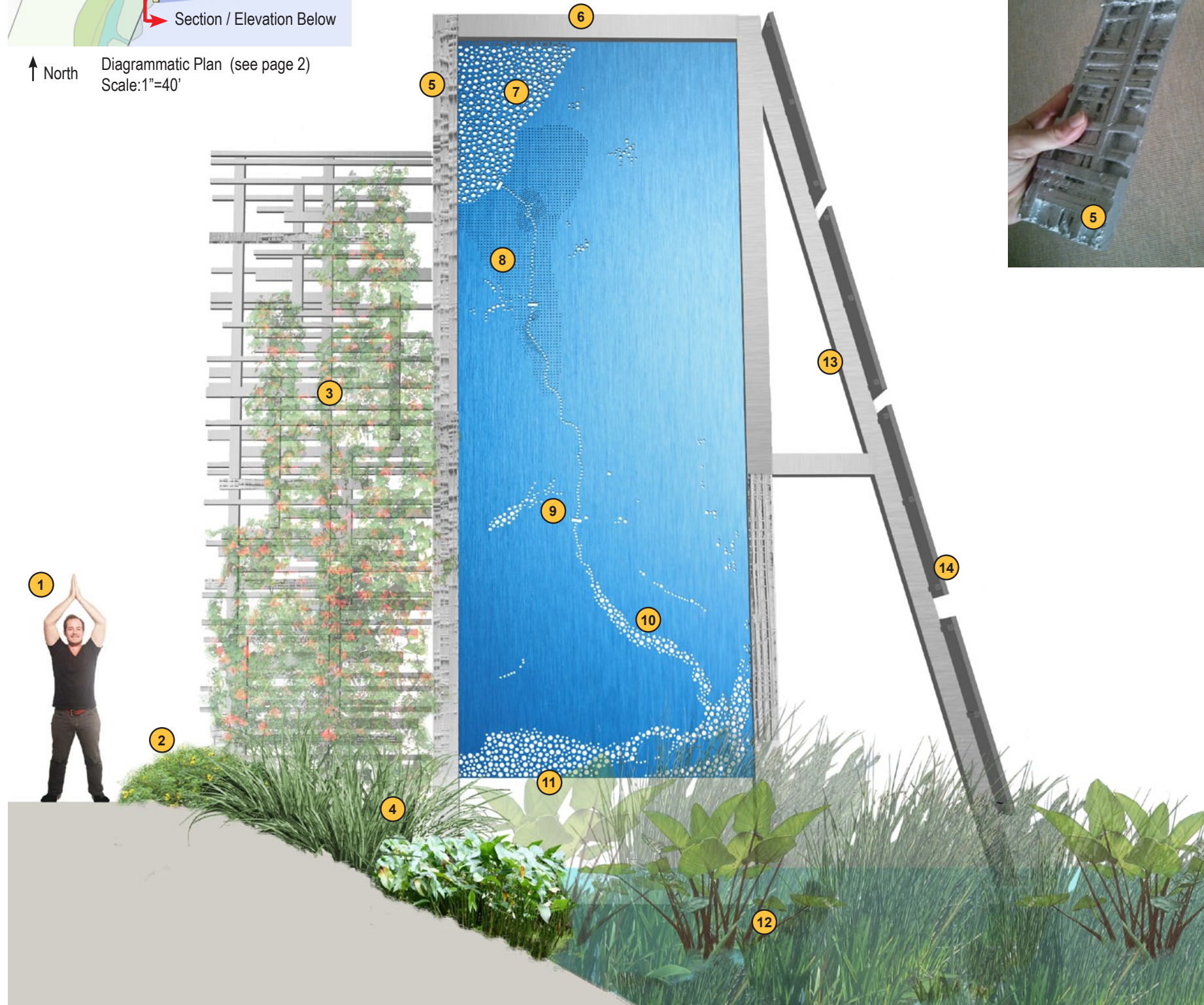
Conceptual Perspectival Section / Elevation Approximate Scale: 1/4"=1'

↑ North Diagrammatic Plan (see page 2) Scale: 1"=40'